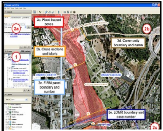
Figure 3. To generate a map of flood hazard information for a place: (1) Select the appropriate layers. (2) Fly to the community (by using "fly to" (2a) or the navigation controls (2b)). Check the eye altitude (2c) to ensure that it is in the low range. (3) Read the map. The sample map shows (3a) flood hazard zones, (3b) cross sections and labels, (3c) community boundaries and names, and (3d) FIRM panel numbers and boundaries, and (3e) a LOMR case number and boundary.