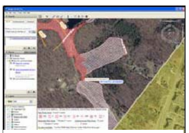
Figure 4. The yellow shading in the lower right means no flood information is available for the area from this service.