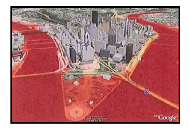
Figure 6. Three-dimensional view of flood hazard areas for Pittsburgh, Pennsylvania. Both flood hazard mapping and Google Earth use terrain data, but the data most likely are different. There may be discrepancies in views that display flood hazard and Google Earth data.